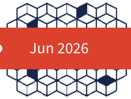
Monthly Vessel Category Counts